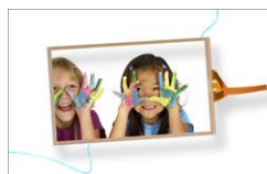
24 Volt Kiosk Printers